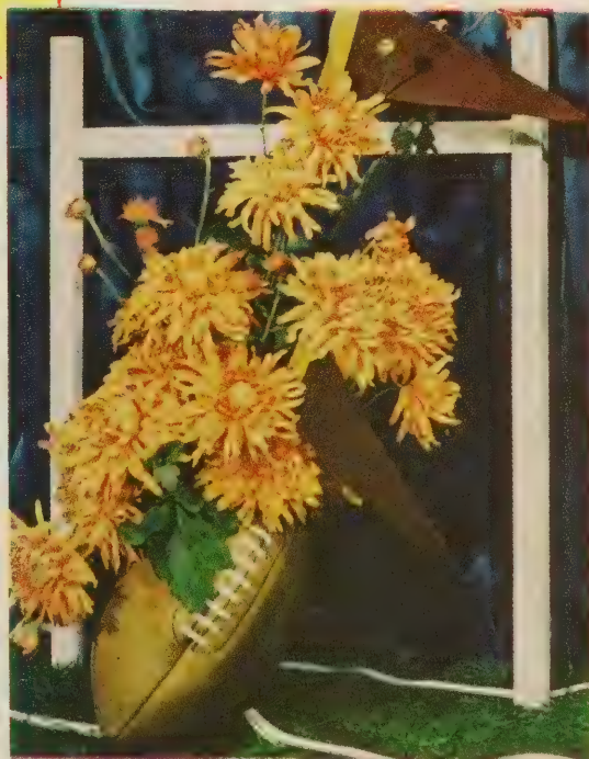
FOOTBALL BRONZE. 75c each; 3 for $2.00